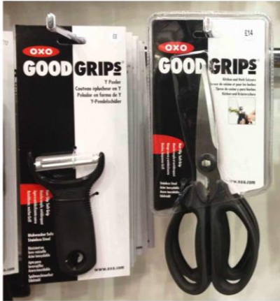
GOOD GRIPS KITCHEN GADGETS