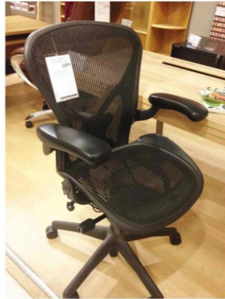
HERMAN MILLER CHAIR