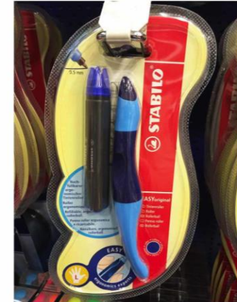
LEFT HANDED PEN

HOW HAS ERGONOMICS IMPACTED ON MY DESIGN?