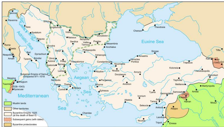
Map A: The extent of the Byzantine Empire in 1025 .

The map below is of the empire in 1025. Annotate the map with the names of the modern countries that made up the Byzantine Empire in 1025.