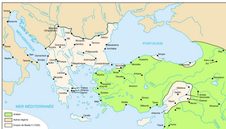
Map B: The extent of the Byzantine Empire in 1076 .

The second map below is of the Empire in 1076. What has happened to the frontiers of the Byzantine Empire between 1025 and 1076?