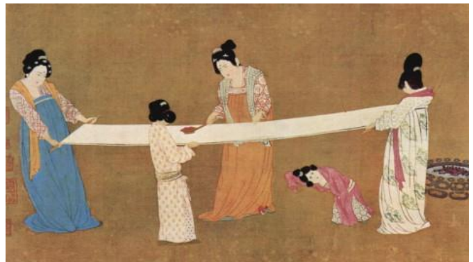
Song Dynasty women inspecting a bolt of silk. 12th century CE. Painted on silk.

What does this illustration tell us about the Song Dynasty?