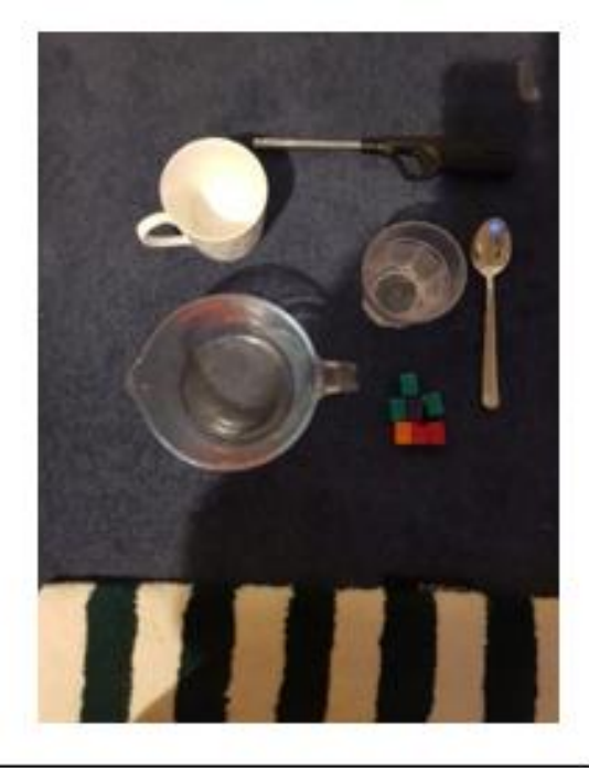
First of all, you will need to gather: one or more small candles, Bicarbonate of soda, Vinegar, a tablespoon, a lighter or match and ½ a litre jug.