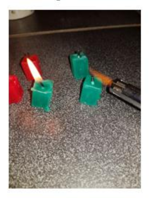
Slowly light your candle/candles so that they are all fully ignited.