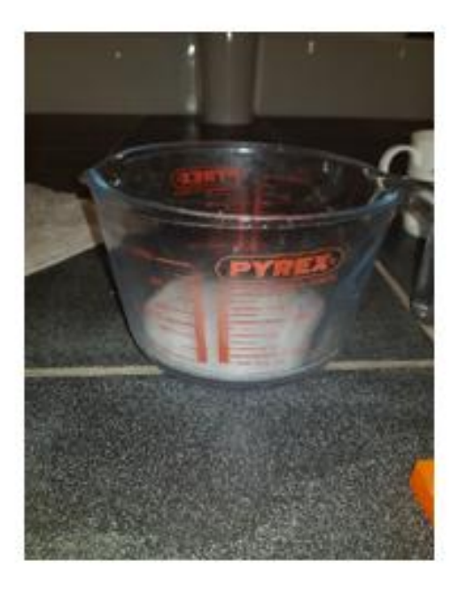
Using the tablespoon, measure ¼ of bicarbonate of soda and put it in the ½ litre jug. Carefully add 100ml of vinegar and then stir the solution with a spoon. There will now be Carbon Dioxide being put off so let the jug stand for approximately 1 to 2 minutes to let the jug fill up with it.